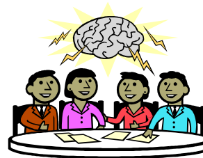
Fundraising Focus Group... We Need You!